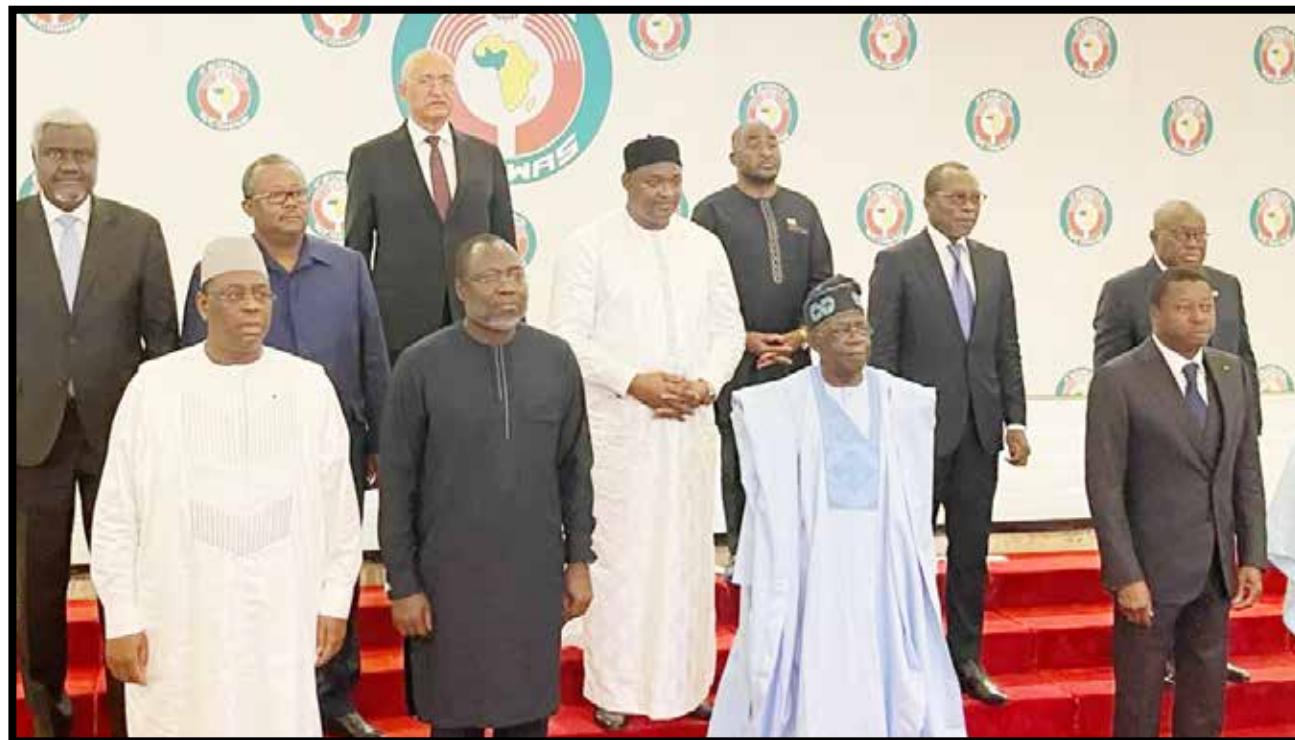
ECOWAS leaders meet to take measures against the coup in Niger.

Both these juntas have targeted France and the EU with militant rhetoric, using both historical memory of colonial brutality as well as the more recent Western failures in counterinsurgency to mobilize support. Yet their posturing only tipped into threats of war when ECOWAS, under Nigerian leadership,