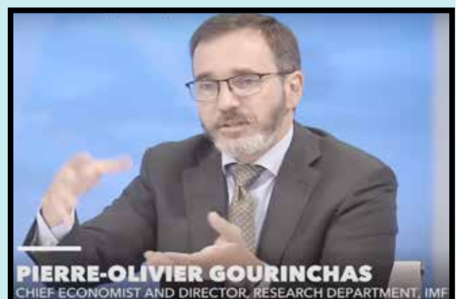
PIERRE-OLIVIER GOURINCHAS CHIEF ECONOMIST AND DIRECTOR, RESEARCH DEPARTMENT, IMF