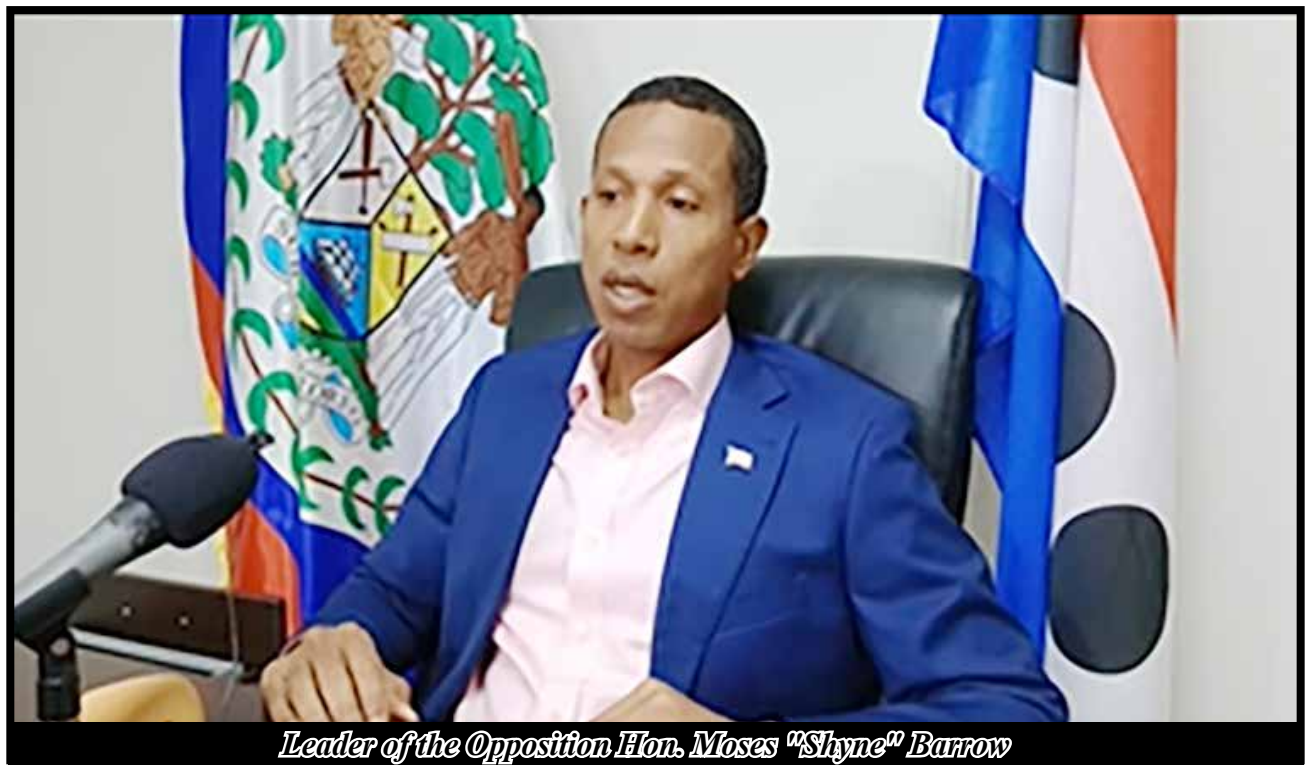
Leader of the Opposition Hon. Moses "Shyne" Barrow