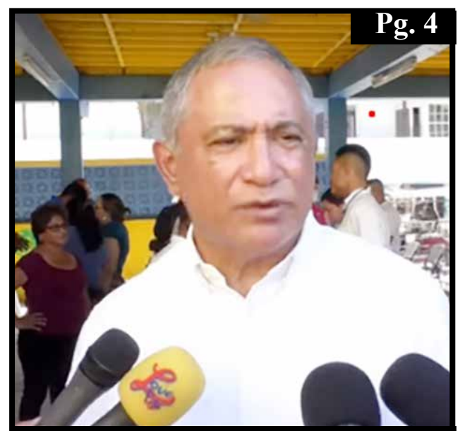
Prime Minister Hon. John Briceño